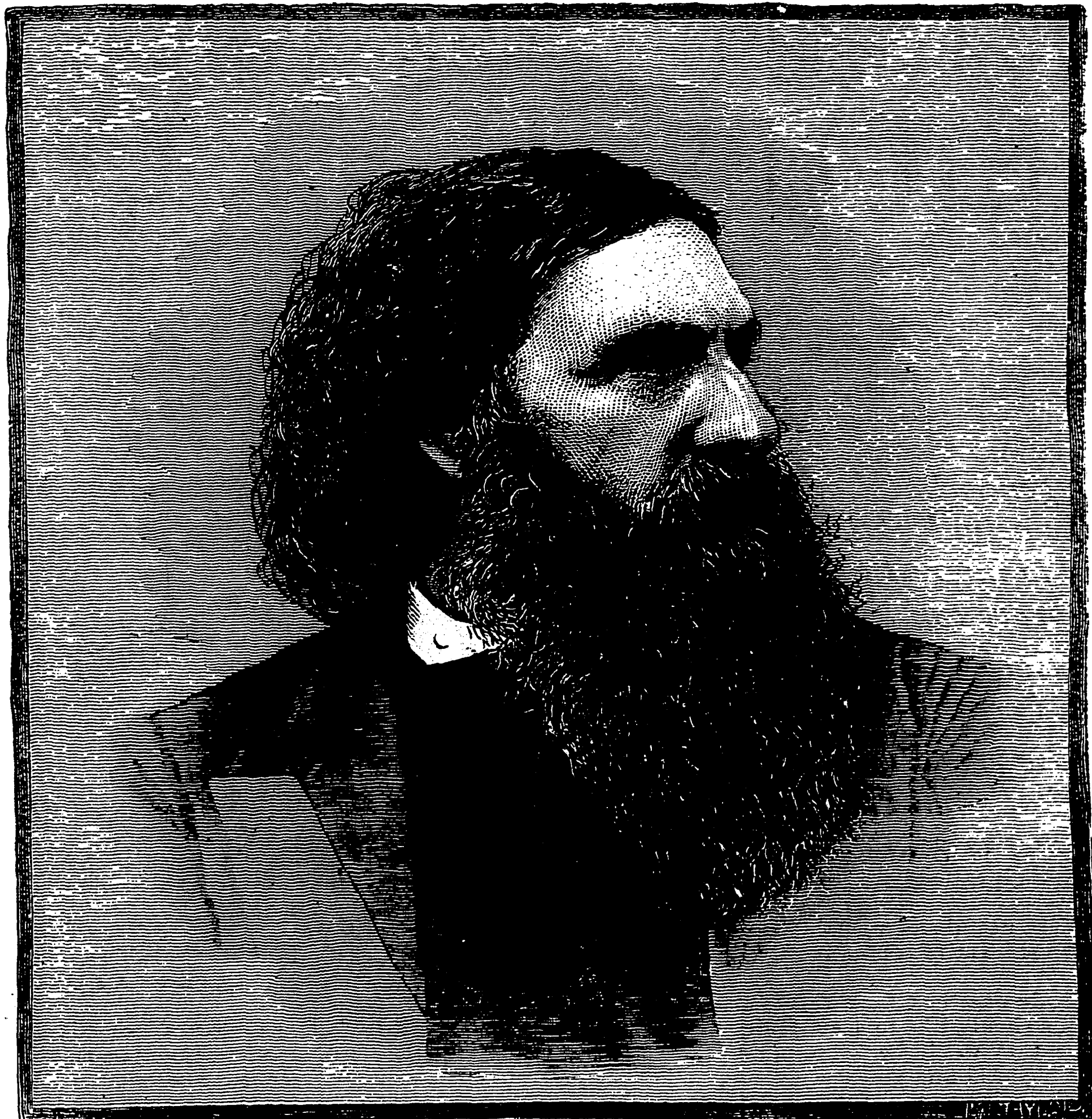
From a Photograph]